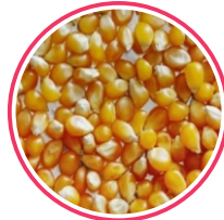
Maize 4 to 6 Kg