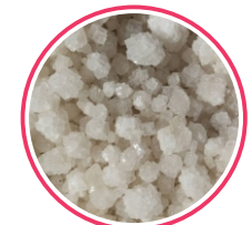
Salt 40 Kg