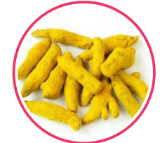
Haldi 8 Kg