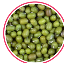
Moong 20 Kg