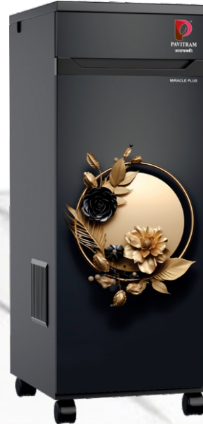
MP - 2