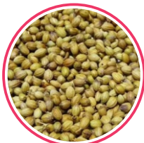
Dhaniya 12 Kg