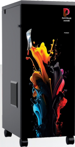
P - 1