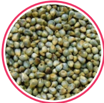
Bajari 4 to 6 Kg