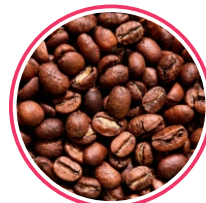
Coffee 20 Kg