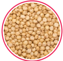
Jowar 4 to 6 Kg