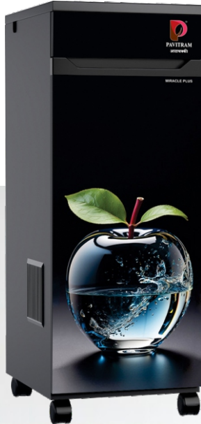
MP - 1