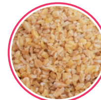
Daliya 40 Kg