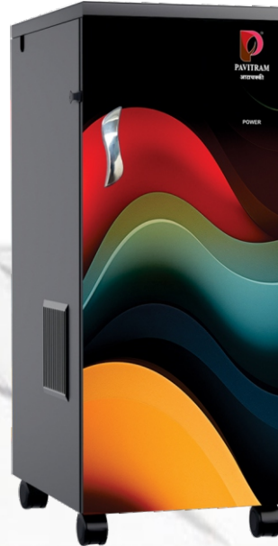
P - 2