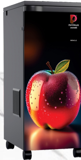
M - 2