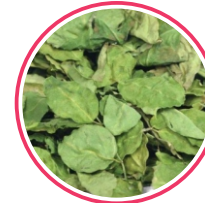
Mehandi 8 Kg