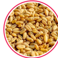
Wheat 6.5 to 8.5 Kg