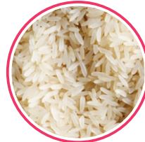
Rice 5 to 7 Kg