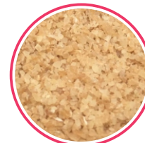
Rava 30 Kg