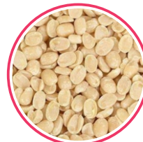
Udad 25 Kg