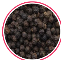
Kali Mirch 12 Kg