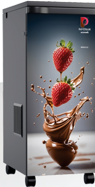
M - 1