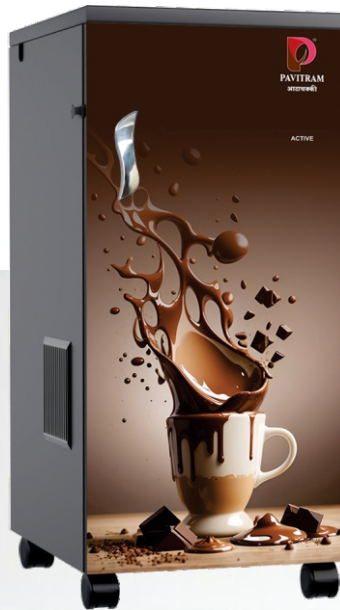
A - 1